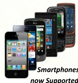
Smartphones now Supported!!!

Earn money with our unique online copy and paste system.